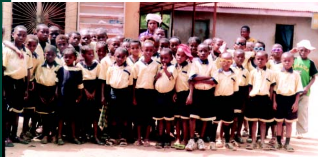
PRIMARY SCHOOL STUDENTS – BRILLIANT MODEL CHRISTIAN SCHOOL