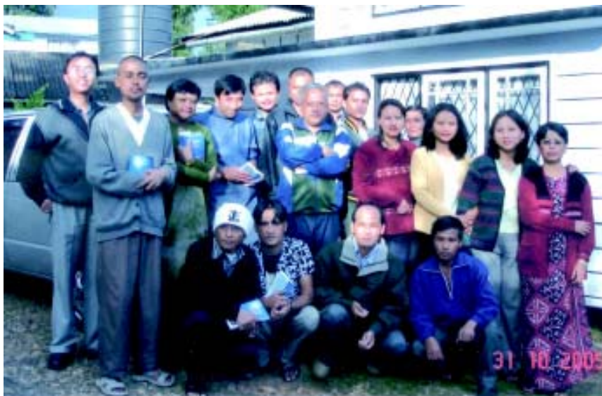
STAFF AND INMATES OF NEW HOPE CENTER RECEIVE THE WORD OF GOD