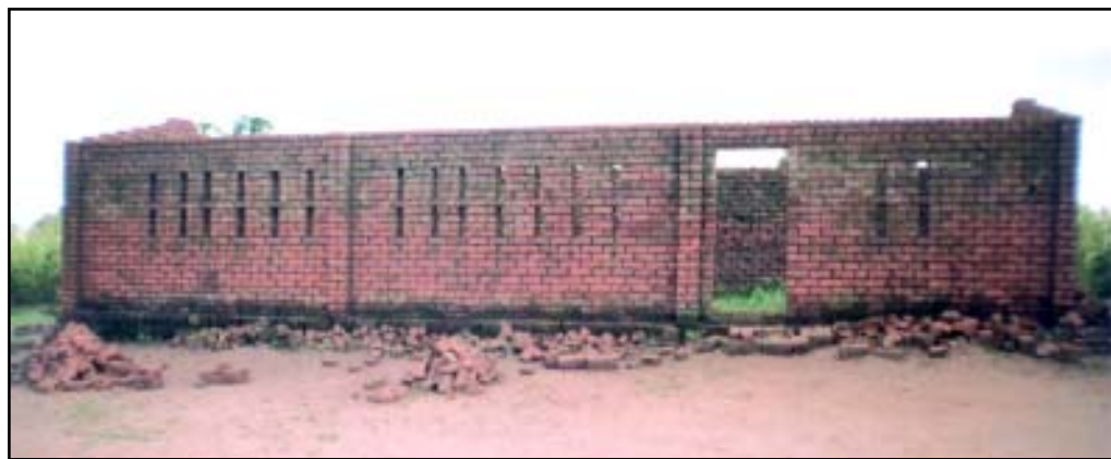
MALAWI ONE OF 15 CHURCHES IN MALAWI AWAITS AN IRON ROOF

We have 40 churches, 25 with sheet roofs, 15 with brick walls and no roof. We care and provide for 35 orphans as best as we can. Help in Malawi is scarce. We ask you to help us with Children's Bibles .