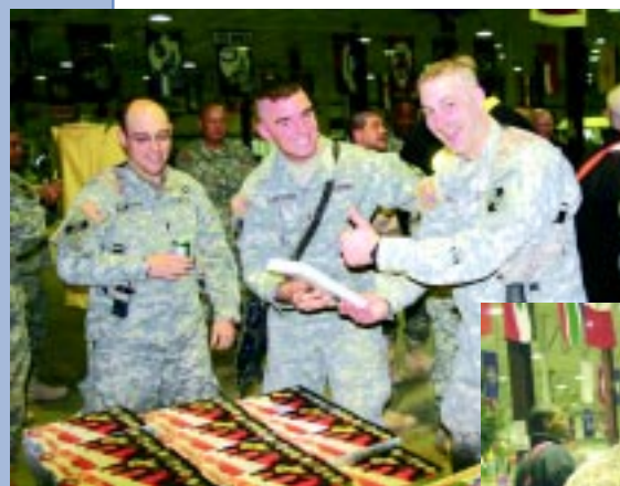
Above and right: BOBP Military Editions were given at a Regimental Troop party in Iraq.

Through your prayers and unsparing generosity 2,400 copies of the Military Edition of The Best of Bible Pathway were given freely to members of all branches of United States service men and women, including retired and veteran military.