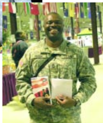
These young service men on the right, picked up cases of Bibles and BOBP's to distribute to troops deploying from Ft. Campbell in Tennessee.

Through your prayers and unsparing generosity 2,400 copies of the Military Edition of The Best of Bible Pathway were given freely to members of all branches of United States service men and women, including retired and veteran military.