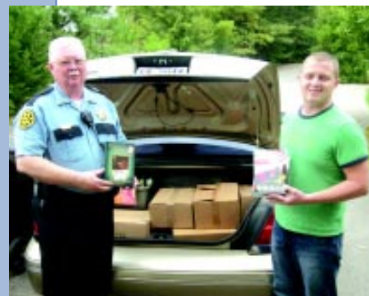
Left: A Sheriff's Chaplain from Montgomery County Jail, outside of Ft. Campbell, TN, and his son picked up Spanish, English, and Military editions of the BOBP for inmates, many of whom are ex-military.